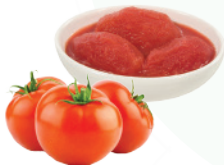
Bruschetta with Peeled Tomatoes 碎番茄面包片